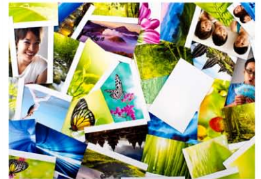
Graphic Design & Photographs

All SmartLF scanners are available in three affordable specification levels: monochrome, color and express color, (m, c, e). m and c models can be easily upgraded via unique email process if requirements change.