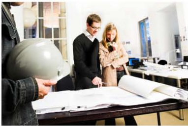
CAD and Technical Drawings

Based on a proven CCD technology, the SmartLF Gx+ 28 is a reliable 28in wide large format scanner that suits the demands of professionals requiring full color graphics. With true 1200dpi optical resolution, the new SmartLF Gx+ 28 has more than enough resolving power for any large format scanning job.