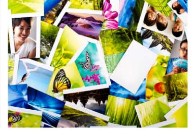
Graphic Design & Photographs

All SmartLF scanners are available in three affordable specification levels: monochrome, color and express color, (m, c, e). m and c models can be easily upgraded via unique email process if requirements change.