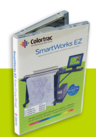
SmartWorks EZ software Everything you need is IN THE BOX!

SmartWorks EZ is optimized for use with touchscreen monitors using a simple, intuitive user interface suitable for general office use.